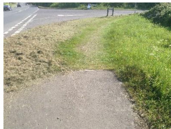
Verge in use as a path