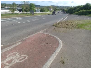
Existing access via busy A39

THE PROPOSAL: Create a Cycle Path to join the existing cycle lane on Bath Road Bridgwater