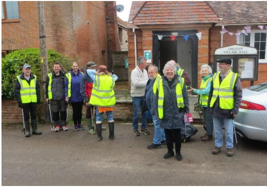
Litter picking group on the Sunday as part of the Big Help Out (Pleased to say Chedzoy was fairly tidy)