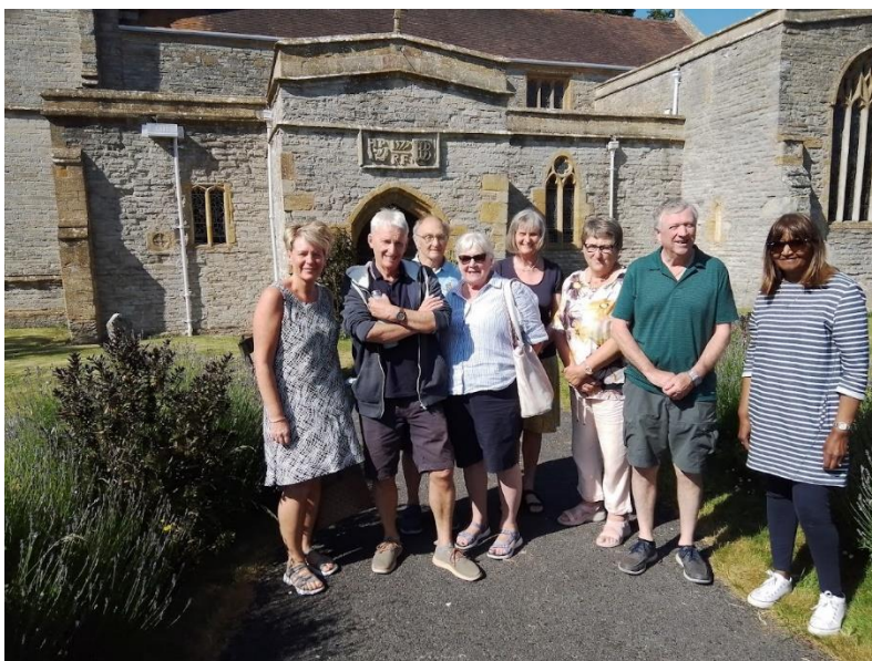
On the left is a group of Wembdon Campanologists who graced Chedzoy Church with their Bell Ringing skills, while on a mini-tour of local churches